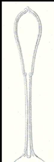
Gorham Co.'s patented design